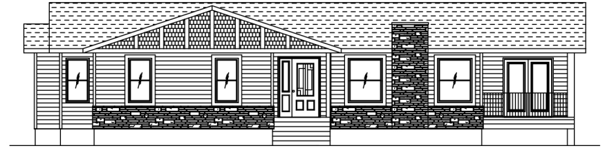
SAMPLE FRONT ELEVATION